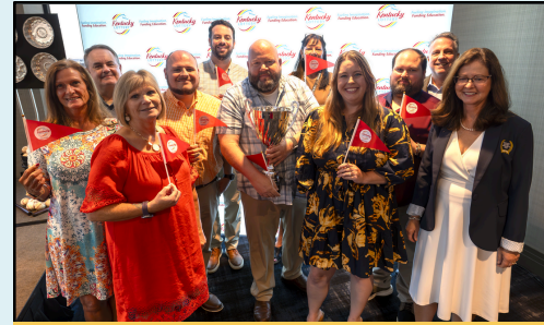
Pictured: The Western Kentucky Region, our top sales region for FY2025.

The Kentucky Lottery held its annual training for our dedicated sales team that works with our 3,500 retailers across the state.