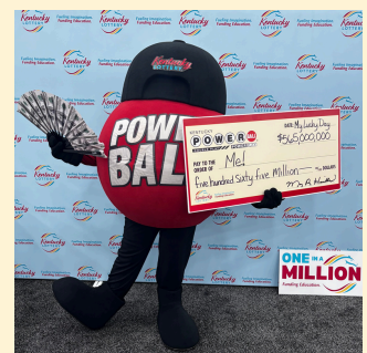
The Powerball mascot was popular among players at the State Fair.

As the Powerball jackpot continues to climb, the Kentucky Lottery is preparing for promotional events around the state. These events engage players and increase Powerball sales to continue to fund scholarships and grants for students across the Commonwealth.